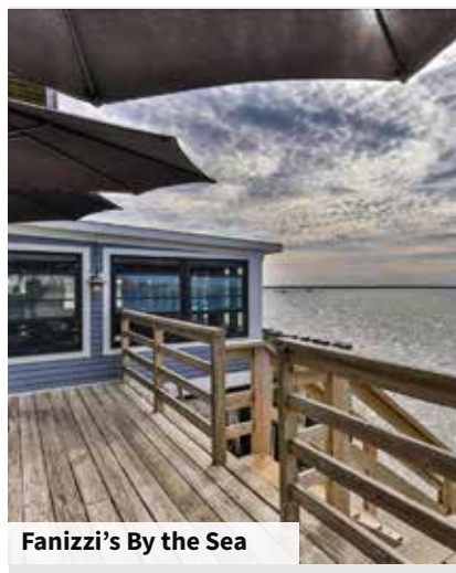
Fanizzi's By the Sea

The month of October has become synonymous with the annual celebration known as OysterFest . With a focus on educating the general public about the shellfish industry, this beloved festival includes crafts, food, fun and entertainment, as well as an in-