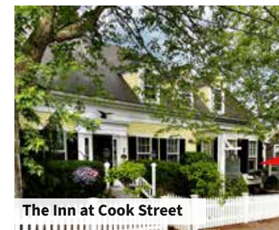
The Inn at Cook Street