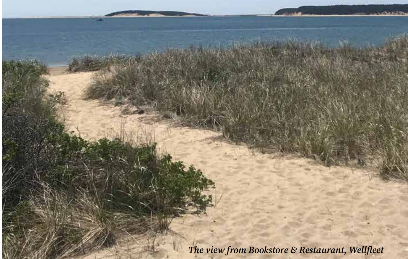
The view from Bookstore & Restaurant, Wellfleet

of being "negative"). The roads are less competitive, as two lanes replace four lanes—the dead end at the physical end of the land, can result in traffic back-ups all the way back to the more competitive thoroughfares—the pace of life feels slower as well. And then there is the beauty, and here is where the negative moves solidly into the positive, the vistas and landscape are overwhelming enough to cause the most impatient among us, to ease up on the accelerator and just drink in the quiet beauty.