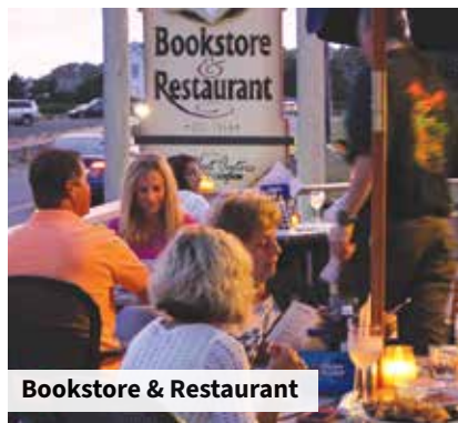
Bookstore & Restaurant

539 Commercial Street Provincetown 508-487-1964 fanizzisrestaurant.com